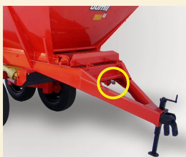
Centralized cardam Better move handling.