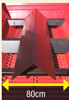
Track width Track with full double lane. Strength for wet organic products. More homogeneous distribution.