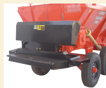
Deflectors (optional) To targeted chemical or organic fertilizers applications.