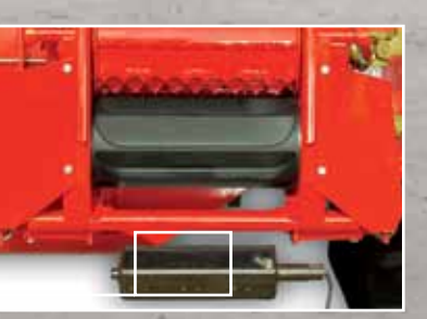
A metal detector in the feed roller is available as an option.