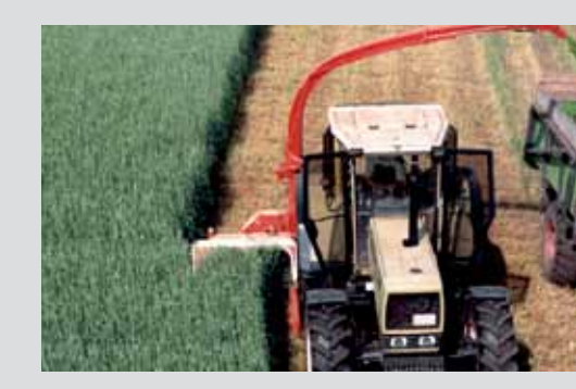
The C 1200 is also highly effective when used for whole crop silage.

The compact, "small" mounted forage harvester with versatile mounting options.